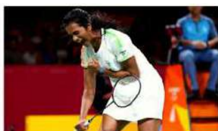
PV Sindhu won the gold medal in the badminton final against Canada's Michelle Li at the 2022 Birmingham Commonwealth Games. File | Photo credit: Getty Images