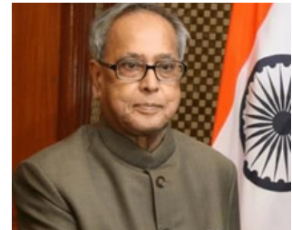
The Banker Who Became President