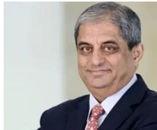
Founder of HDFC Bank