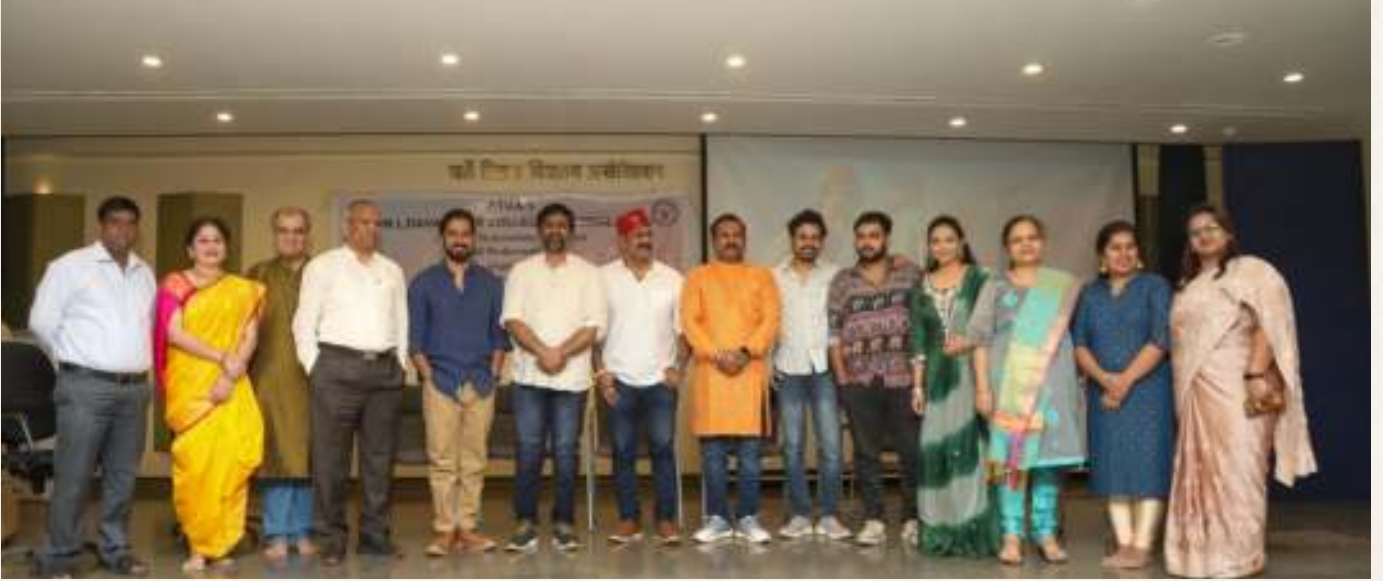
BAMMC Department on stage with the team of Marathi film Subhedar.

The highlight of the event was a play performed by members of the club called "Cheda". Keeping everyone hooked till the end, the play was a rollercoaster of emotions with its message delivered subtly, as it received a standing ovation from the audience. Praised by the professors present and seniors alike, the play was received well by everyone, leaving a lasting impression. In the end, the club was successful in delivering its motto of developing confidence and personality among the students.