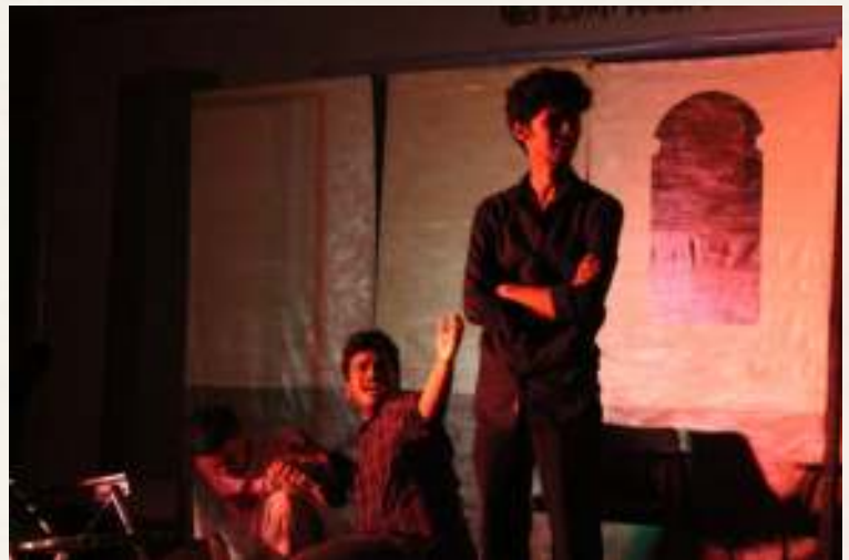
Still from the Illuminaty Club's play.

Sharing their experiences to encourage new students to join the club were its founding members. Afterwards, an energetic dance performance was followed by a lively interaction between the club's coordinator and president with the audience to help develop a sense of friendliness among them.