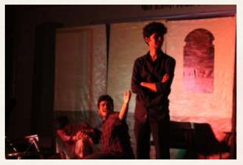
Still from the Illuminaty Club's play.

Sharing their experiences to encourage new students to join the club were its founding members. Afterwards, an energetic dance performance was followed by a lively interaction between the club's coordinator and president with the audience to help develop a sense of friendliness among them.