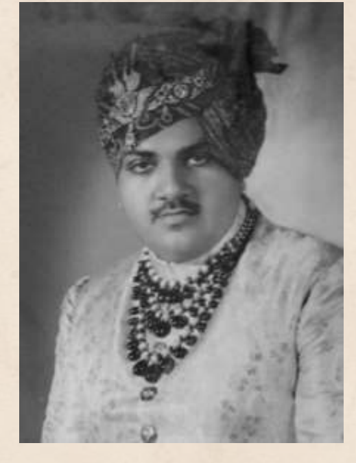
https://upload.wikimedia.org/wikipedia/c ommons/thumb/f/f2/Hanwant_Singh.jpg/ 220px-Hanwant_Singh.jpg