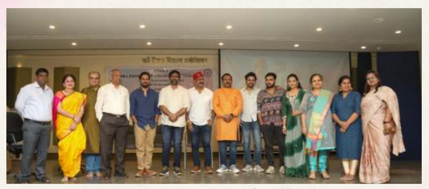
BAMMC Department on stage with the team of Marathi film Subhedar.

The highlight of the event was a play performed by members of the club called "Cheda". Keeping everyone hooked till the end, the play was a rollercoaster of emotions with its message delivered subtly, as it received a standing ovation from the audience. Praised by the professors present and seniors alike, the play was received well by everyone, leaving a lasting impression. In the end, the club was successful in delivering its motto of developing confidence and personality among the students.