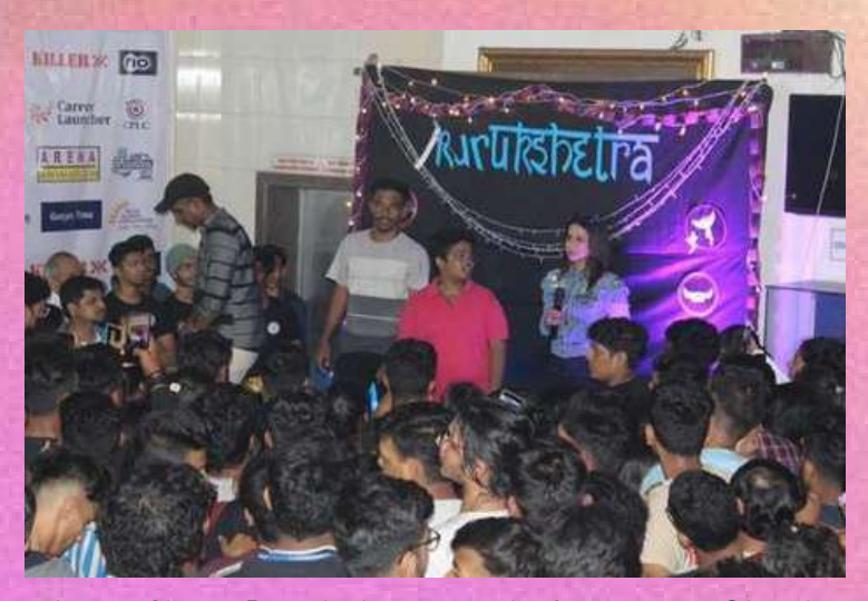
Actress Shreya Bugade dancing on the famous song Chandra with college students

Who doesn't like to dance be it the posh Waltz, the elegant Ballet, upbeating Hip hop or just the regular Ganpati Visarjan dance or popularly known as the wedding street dance. ABCD Any body can dance. Distributed into further subevents like Street dance or the Solo/Duet or the group dance. It always takes the cake when capturing the audience.