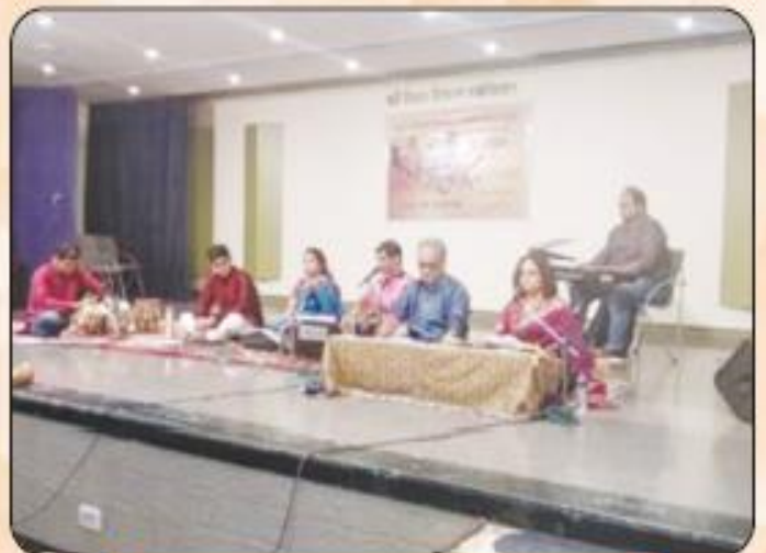
मराठी वाङ्मय मंडळ