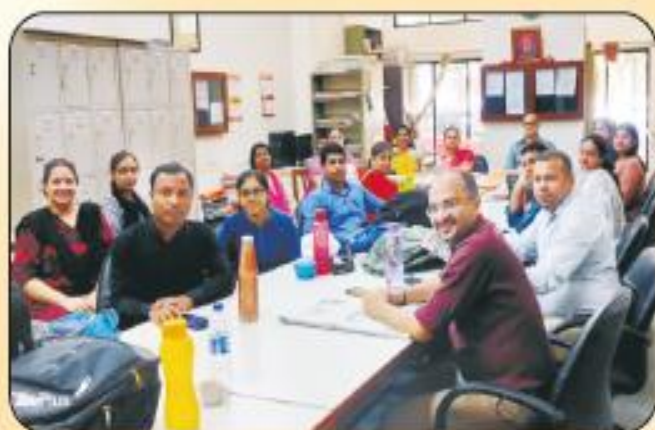
Staffroom (Aided Section)