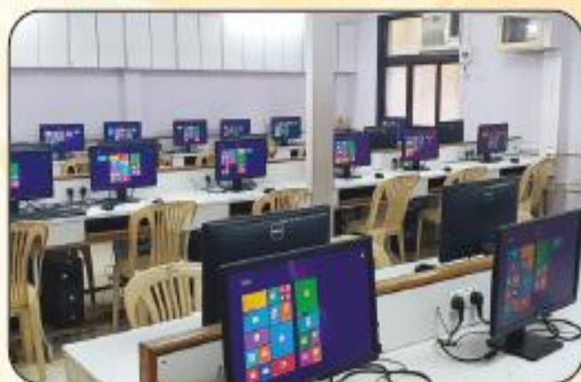
Computer Laboratory 2