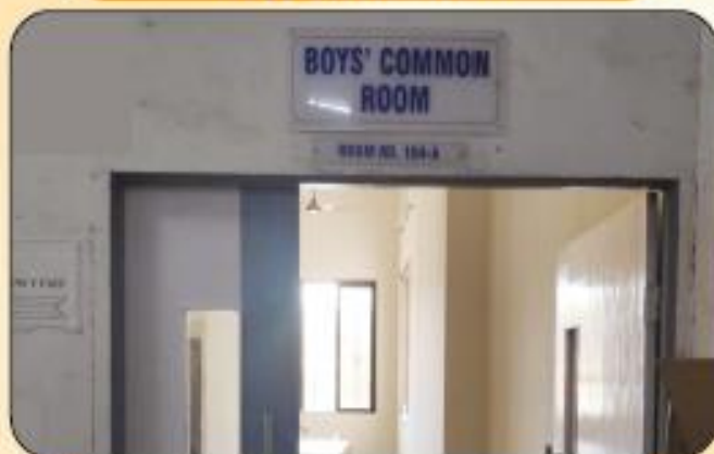
Boys Common Room