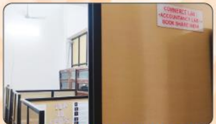
COMMERCE LAB AND ACCOUNTANCY LAB