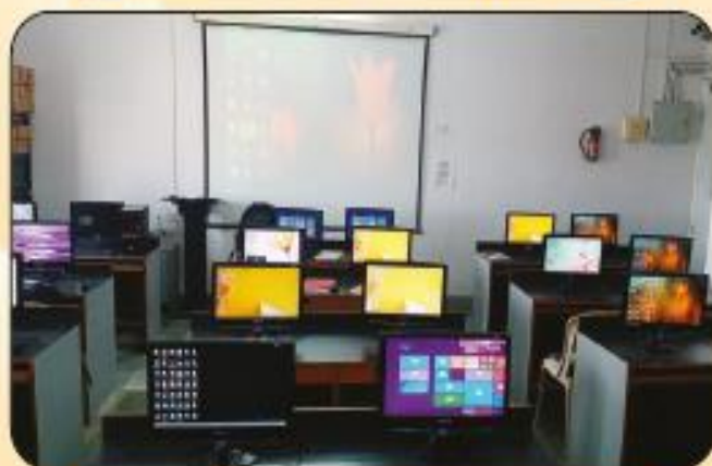
Computer Laboratory 4