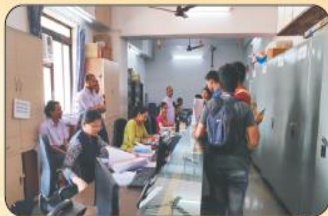
S.F.C. Administrative Office