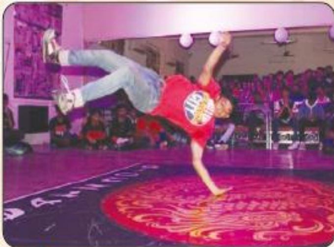
DAHANUKAR DANCING DUDES (D4)