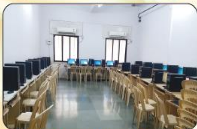
Computer Laboratory 1