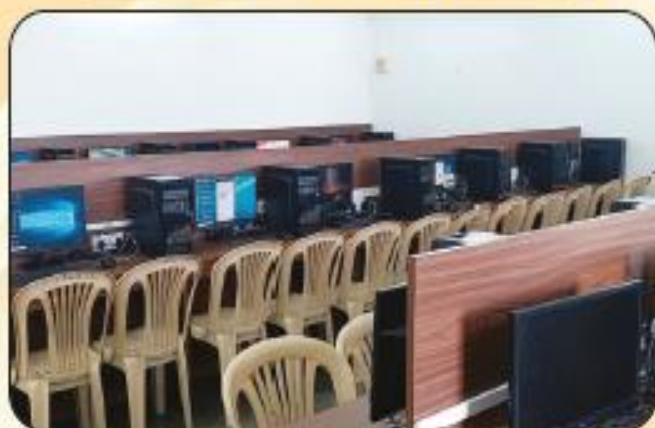
Computer Laboratory 3