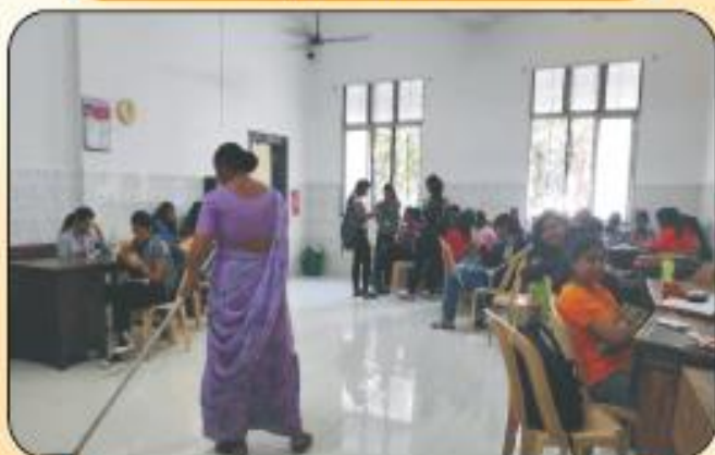
Ladies Common Room