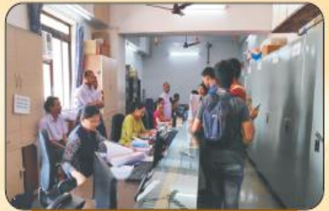
S.F.C. Administrative Office