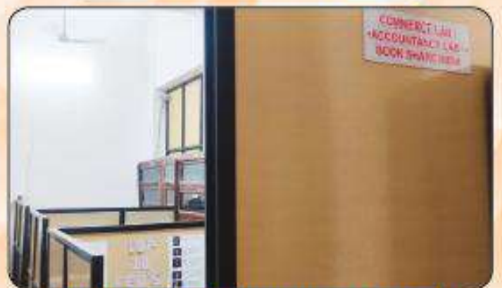
COMMERCE LAB AND ACCOUNTANCY LAB