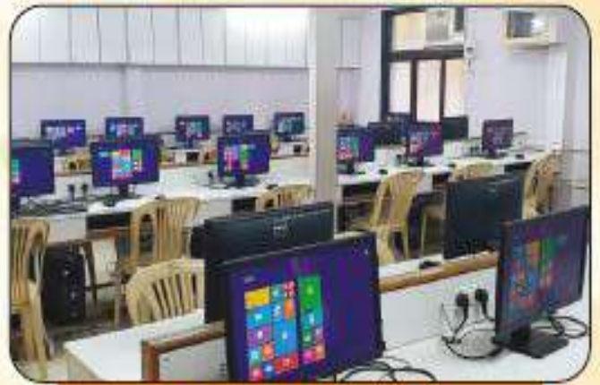
Computer Laboratory 2