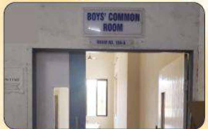
Boys Common Room