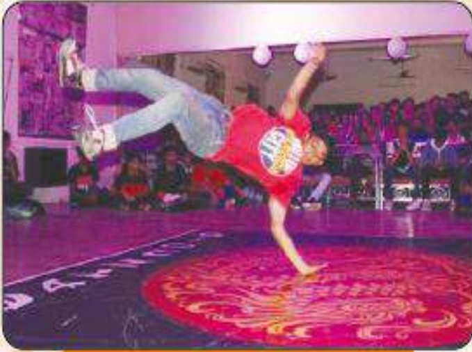
DAHANUKAR DANCING DUDES (D4)