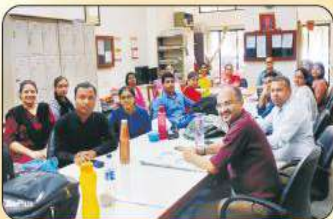
Staffroom (Aided Section)