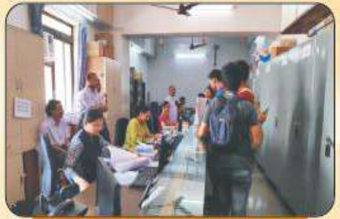
S.F.C. Administrative Office