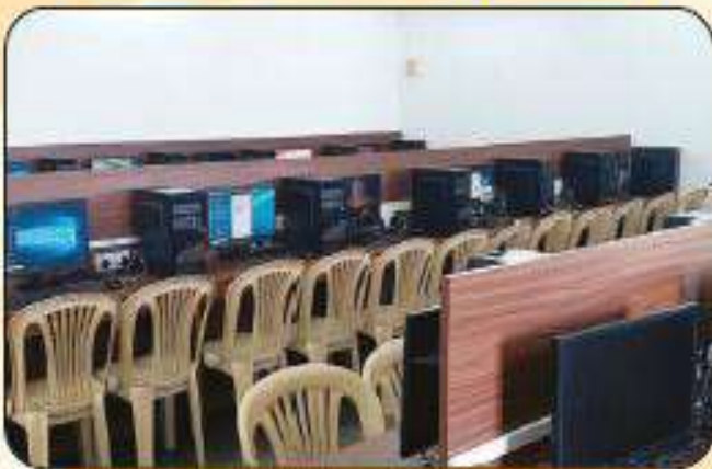
Computer Laboratory 3