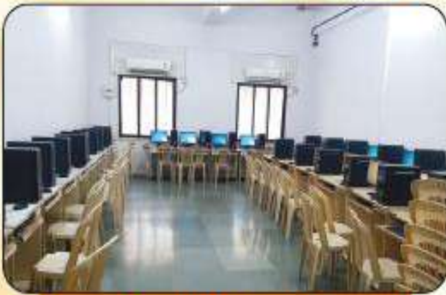
Computer Laboratory 1