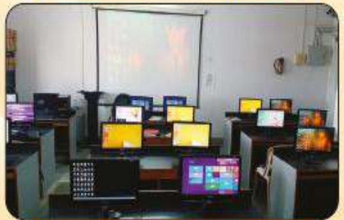
Computer Laboratory 4