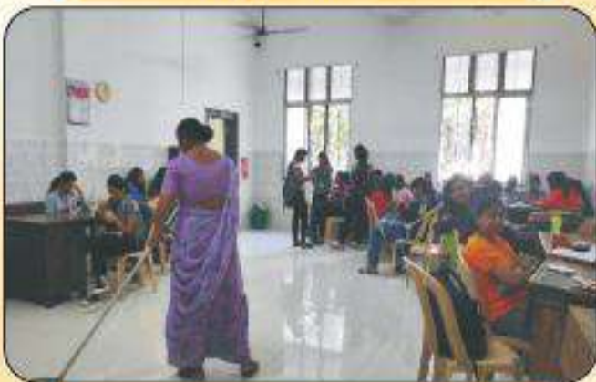
Ladies Common Room