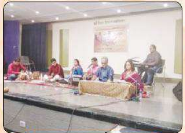
मराठी वाङ्मय मंडळ